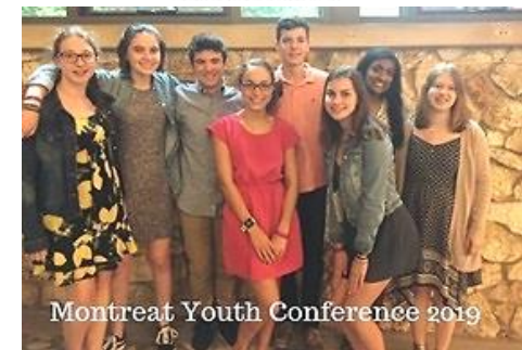
Montreat Youth Conference 2019