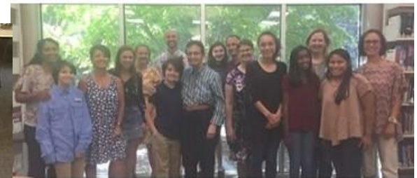
2019 Confirmation Class and Mentors