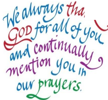
I Thessalonians 1:2, NIV